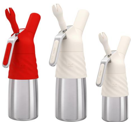
Creative Whip 0,5L & 0,25L