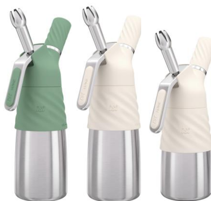
Creative Whip Premium 0,5L & 0,25L